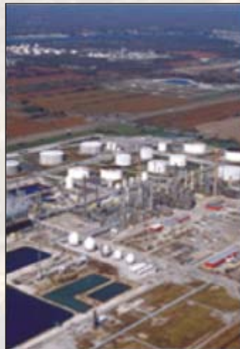
NOVA Corunna Site