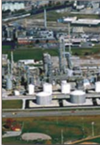
NOVA Sarnia Site

At CSM, we have found a way to hold onto our current maintenance agreement commitments all the while expand our projects division to support the needs of our customers. The mix allows us to remain competitive and employ the best workers in both segments of the marketplace. This strategy also allows us to strengthen our commitment to safety and quality due to a smaller turnover of tradesmen.